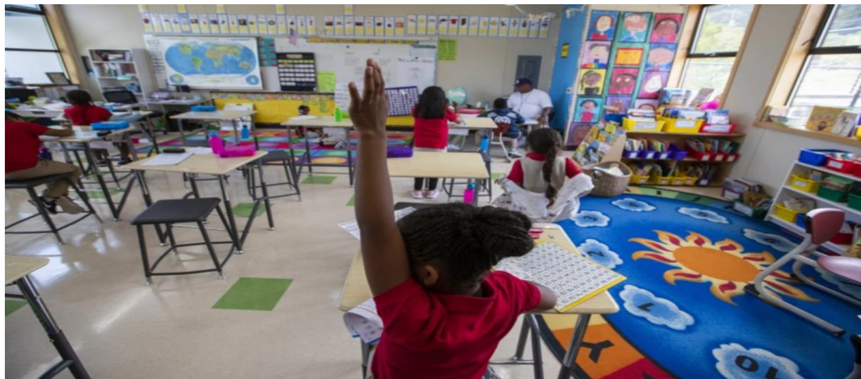
Students participate in a math class at Bayside Martin Luther King Jr. Academy in Sausalito, Calif. The Sausalito Marin City School District is under a state court order to end the unequal treatment of Bayside MLK students.