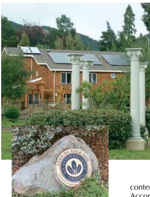
Taking to heart the Dominican Sisters' commitment to protecting Mother Earth, the Jane d'Aza Convent building was crafted to the highest LEED standards, earning the gold level in certification for building and design and architecture.