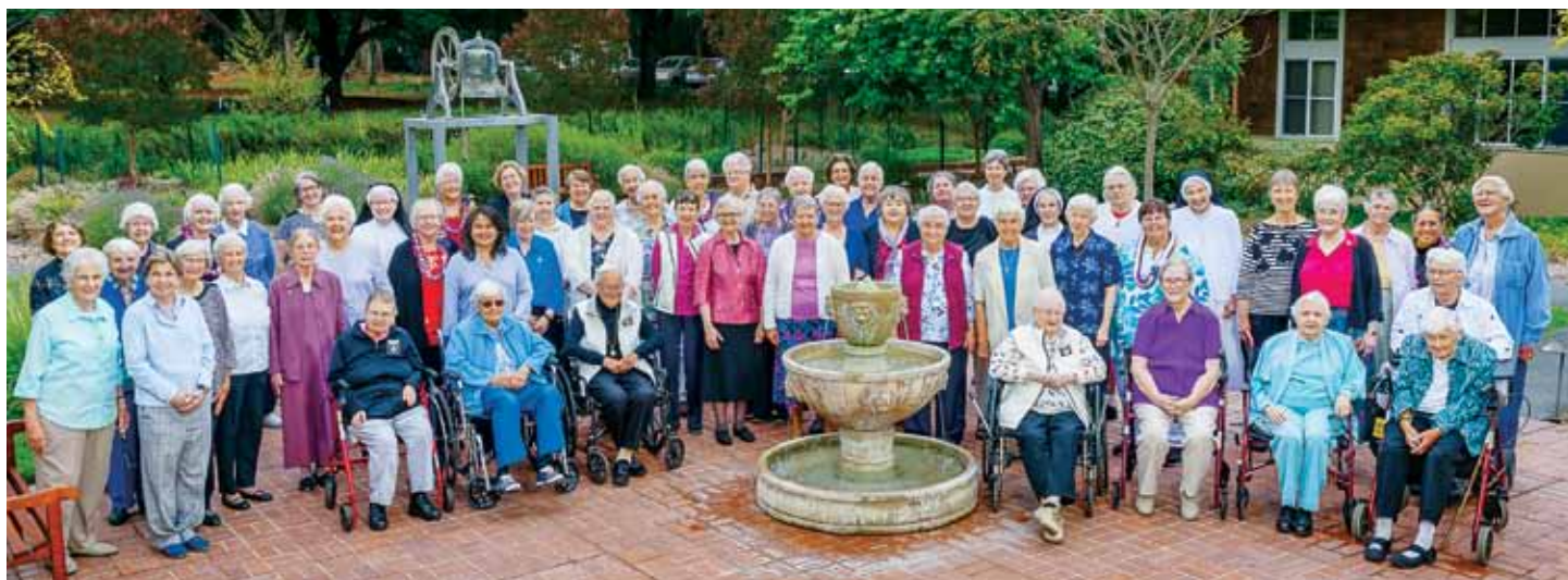
The Dominican Sisters of San Rafael gather each summer to honor and celebrate the Jubilarians, each of whom was profiled in the last issue of OP Ignite. Watch for information about Jubilee 2020!

*We make every effort to assure all donors are properly listed in our report. If your name was inadvertently left out or listed incorrectly, we apologize. Please contact the Administration Office at 415.453.8303 or email develop@sanrafaelop.org to advise us of this error. Thank you.